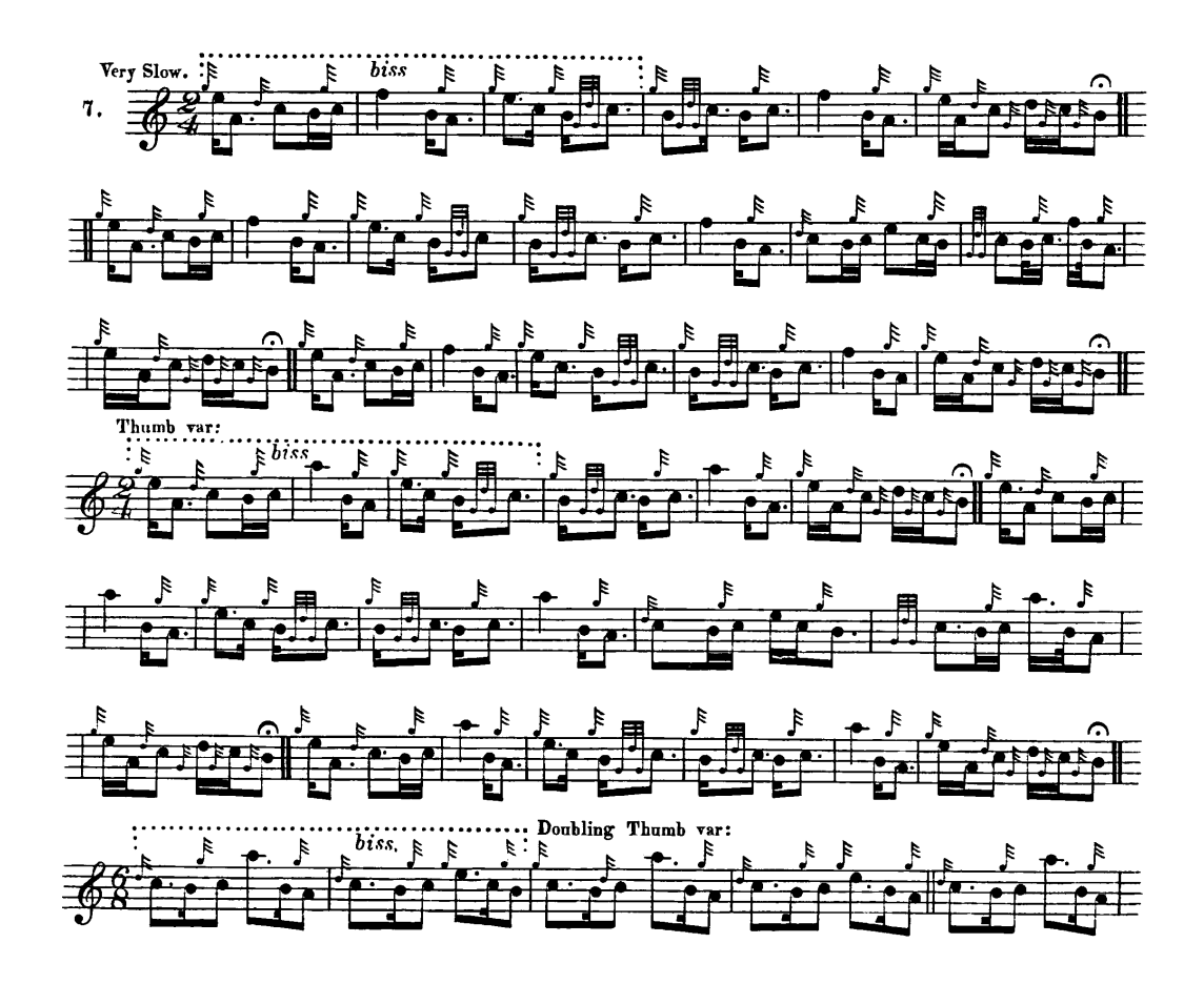
MAOL DONN. Mac.CRUIMMON'S SWEETHEART.

Uilleam Ross's Collection of 1869 contains the first published setting of 'MacCrimmon's Sweetheart', and is amongst the most attractive. It is given below: